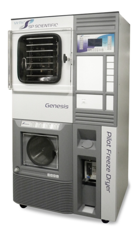
(Standard configuration Genesis 35L shown)